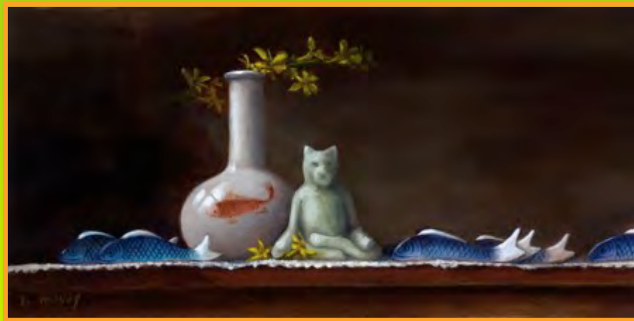
Sitting in the Stream, 6"x 12" oil on panel

Diana Harvey will be having a show at the Art4Spirit on upper Spring Street in Eureka Springs, during the month of May. The opening reception is May 6, from 5:00 to 8:00 p.m. All are invited.